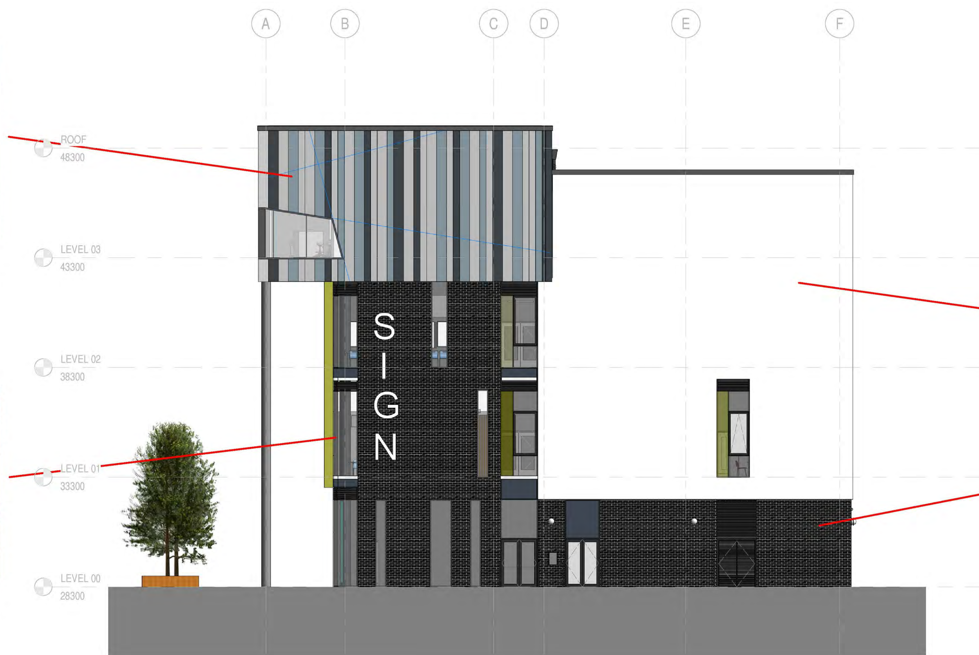
1 ELEVATION SOUTH 1 : 100

FOR AREAS OF CURTAIN WALLING ALLOW FOR THE FOLLOWING: - 40% FIXED CLEAR GLAZING - 10% OPENING CLEAR GLAZING - 10% COLOURED GLASS - 20% OPAQUE PANELS WITH AN ANODISED ALUMINIUM FINISH - 20% POWDER COATED LOUVRES - PROVIDE A SHUCO CAPLESS SYSTEM - INCLUDE PROJECTING SOLAR SHADING FINS